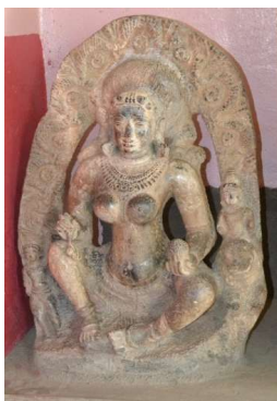
Fig. 1 Yakshi Kushmandini