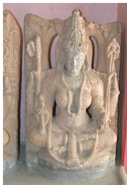
Fig.2 Yakshi Padmavati

Photographs from NeminathaBasadiMalakhed