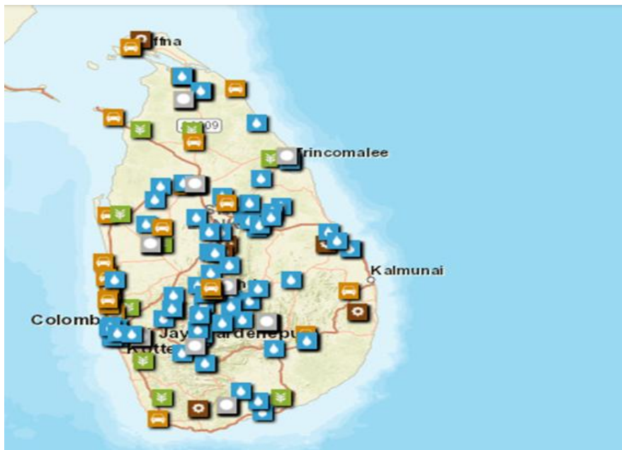
Figure 03: The World Bank's support projects in Sri Lanka

Source: http://.worldbank.org/Sri-Lanka-Country-