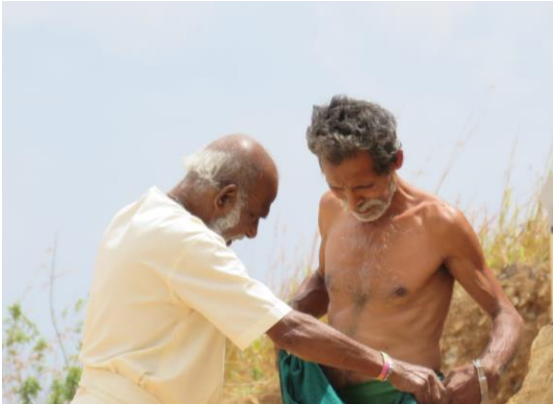
Picture 01- The director is dressing up an actor (A working still of 'Walapane Satana' film)

age the costumes or build film sets. However, they have managed to recreate everything as much as possible using all the resources they had.