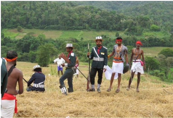
Picture 02- Dressed up actors (A working still of 'Walapane Satana' film)

Production Management - Munidasa mentioned that the entire production did cost 30,000 Sri Lankan rupees only. Finding 30,000 (average 200 US dollars) rupees also was a difficult task, and they have shot the film from time to time depending on the money they have. They have no idea about budgeting and production management. Munidasa Punchihewa's pension was the only source of funds. When it comes to food and transportation, they have been provided breakfast, lunch and sometimes dinner to the film set by the villagers who live closer to the set. Three-wheel drivers have