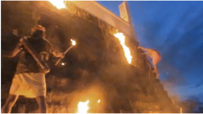
Picture 06 - One actor is falling down from the wall (A shot from 'Walapane Satana' film)