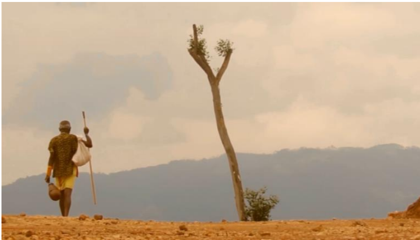
Picture 05 - A shot from 'Walapane Satana' film

Sometimes the audience can notice the camera jerks. It's because they have no idea about the camera techniques, lighting and sound engineering of a film. They have shot this using natural light. Because of that, the audience can notice disturbances while watching the movie. Most of the scenes of this film are outdoor scenes like near a waterfall or in a forest. Since they haven't used a proper sound recording method, the audience can't hear the dialogues of few scenes. But the most important fact is, though there are many technical errors, some shots in this film are highly cinematic.