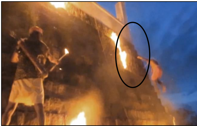
Picture 07 - One actor is falling down from the wall (A shot from 'Walapane Satana' film)

And the most inspirational fact is that he has come to the set a few days later to support his fellow crew members after receiving treatments.